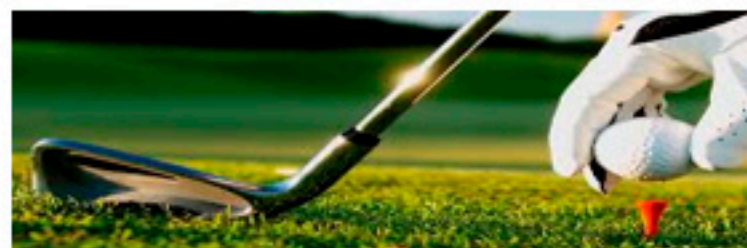
Supporting two great causes this year